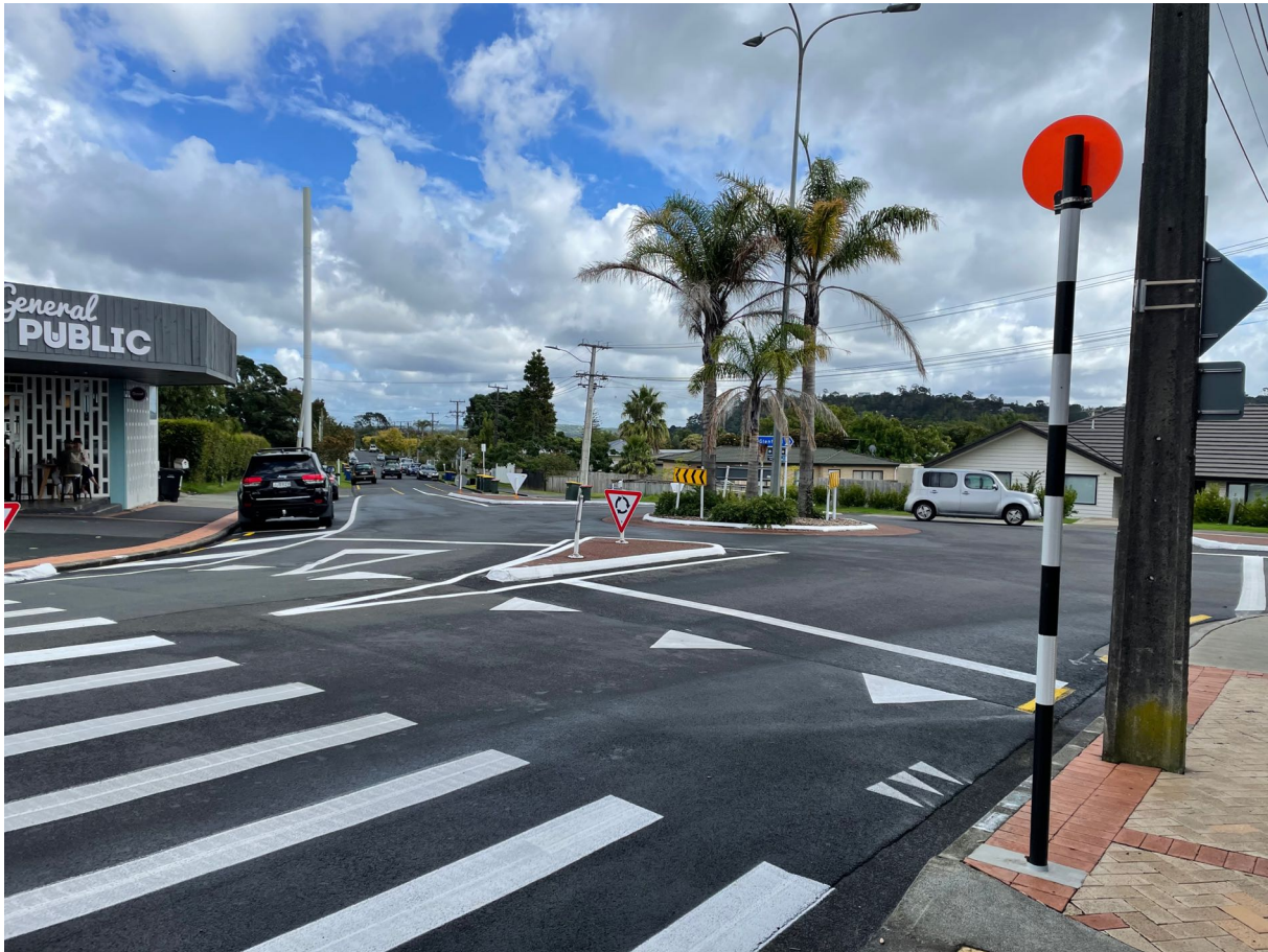
Photograph 1: Beach Haven Road/ Rangitira Road Roundabout

Given the minimal queuing observed, no in-depth modelling calibration was considered necessary – the SIDRA models reflected operation observed on-site.